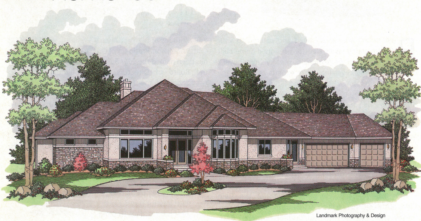
Landmark Photography &amp; Design